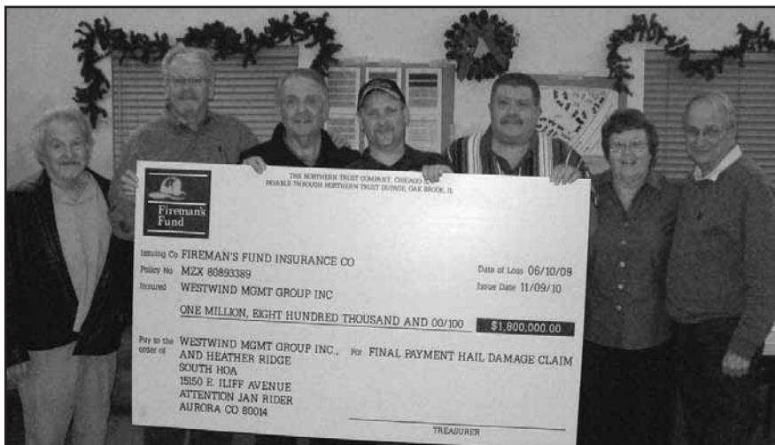
Heather Ridge South Board Directors proudly hold a copy of the check from Fireman's Fund Insurance company for $1.8 million dollars, a settlement for hail damage to HRS roofs.