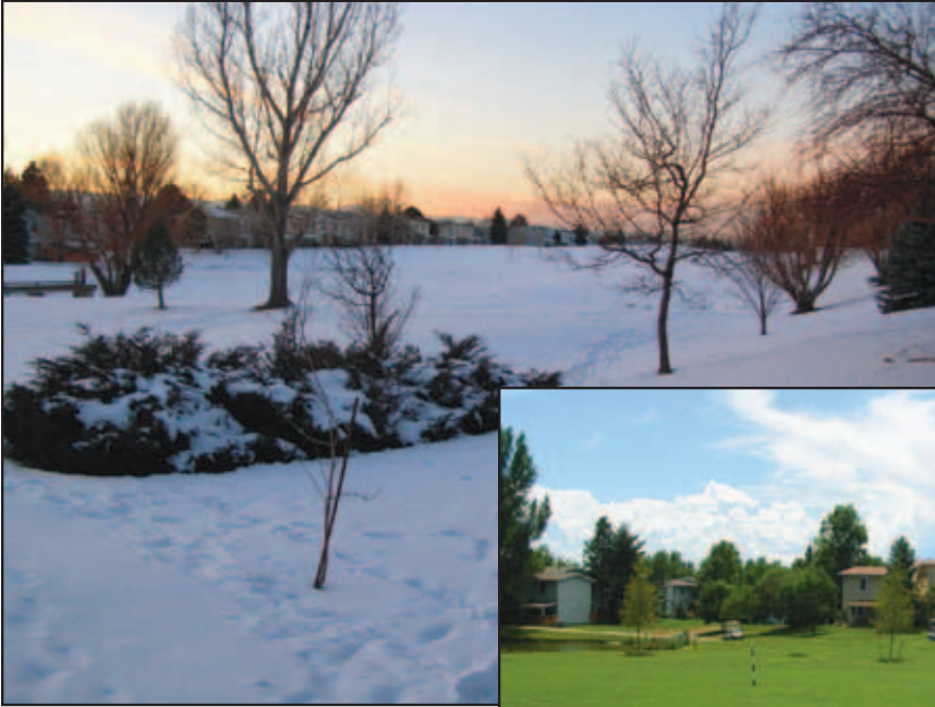
Above: Contrast photos of Fairway 16 in February and July, although not from the same location.