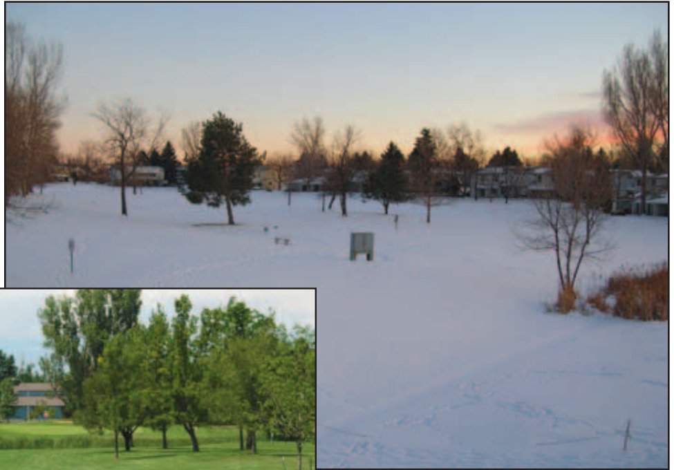
Below: HRS in July, photographed from a golf cart. Orientation is looking at the same green, but look-