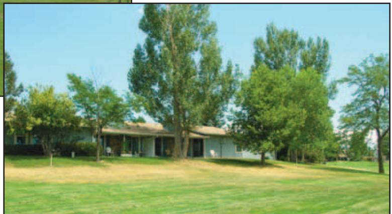
Right: HRS home shaded by leafy trees.