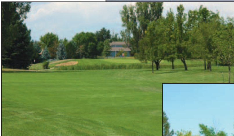
ing Northwest towards Yale Avenue.