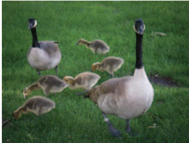
This gaggle is one of two geese families that hatched this year in Heather Ridge. This family started with 6 goslings but something happened to one during that first week. They hatched the day before Mother's Day. This photo was taken in May.