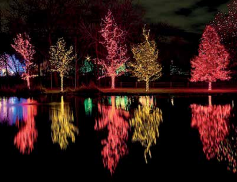
Above: Hudson Christmas. Below: Denver Zoo Lights