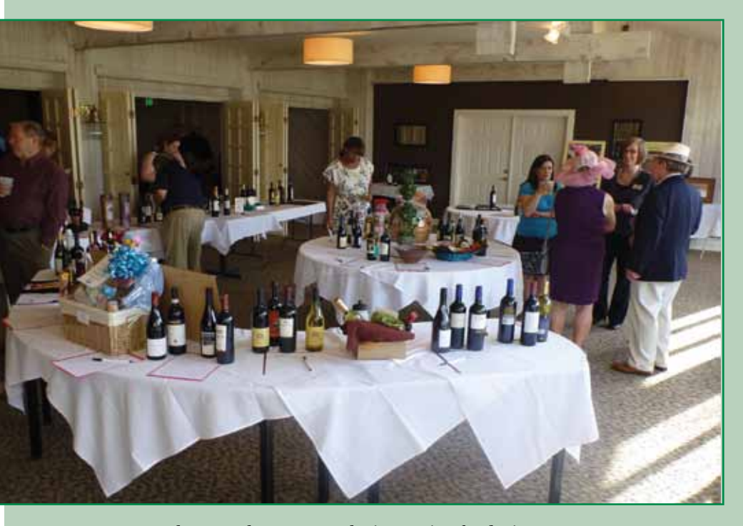
Aurora Symphony Orchestra annual wine tasting fundraiser event.

we completely remodeled the event center bar to accommodate a higher volume of guests at one time. Included in the remodel was the addition of 6 draft beer lines via two large keggerator units. This remodel was extensive in the fact that we had to replace the subflooring to